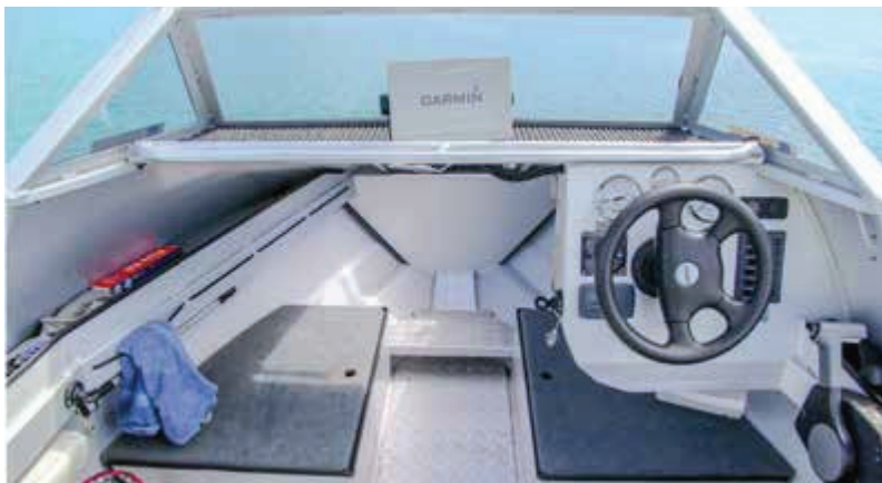
Below: Simple helm equals more space for fishing essentials.

Underway, the 495 is a nimble little boat. It responds quickly and predictably to the helm and the ride is in keeping with most modern Kiwi alloy boats in that it absorbs wave-shock well, especially for a boat of its size. I'd characterise the ride in the almost one-metre chop we encountered as firm, though not too harsh.